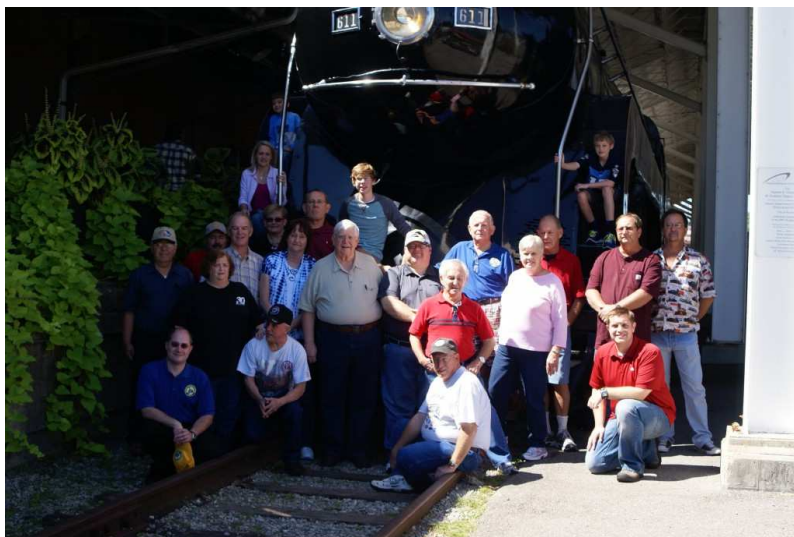
WVRHS&M crew posing in front of ex-N&W #611 during their September 14 th field trip to Roanoke. You'll have to look closely to see those hidden by the shade.