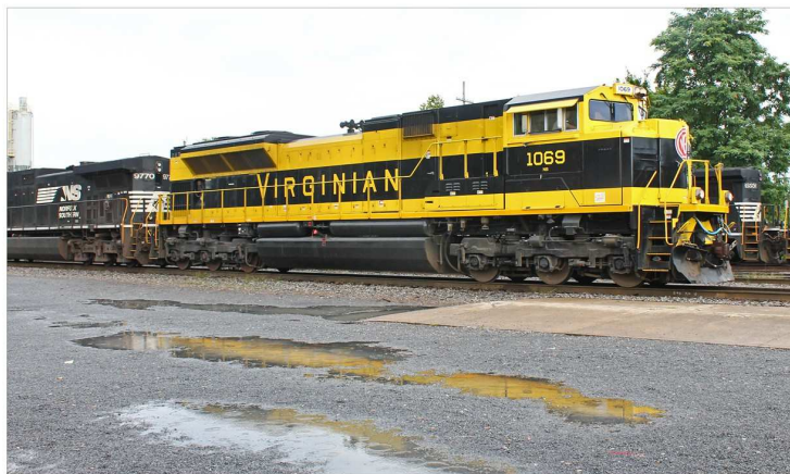
NS SD70ACe Heritage Unit #1069 recently captured entering Bristol in the lead of train 22A.