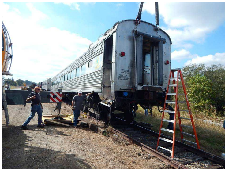
A crane hoists the Crescent Harbor off of its truck for wheel removal.

We cannot promise but are hoping to have the “Crescent Harbor” and “Moultrie” on the Spencer Trips. The inspections this week [of the 17 th ] will determine if this will happen. We will keep everyone informed about the progress of the repair work. Check our facebook page for an update.