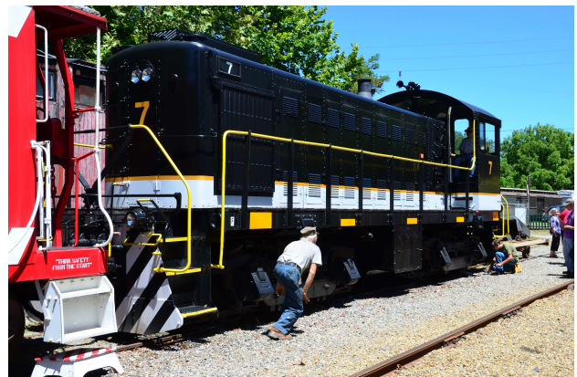
The CML crew "fired-up" their ALCO S3 No. 7 to the delight of attendees. The former Pennsy switcher was acquired by CML in 2012 from the Alexander (NC) NRHS chapter.